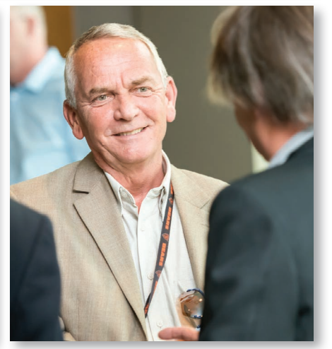
FIND MORE PHOTOS ON TMA'S FACEBOOK PAGE