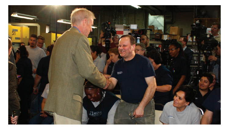
and employees, the governor said.

The current system allows employees to claim injuries not work-related as work-related, causing employers to pay higher fees for something that was not their fault.