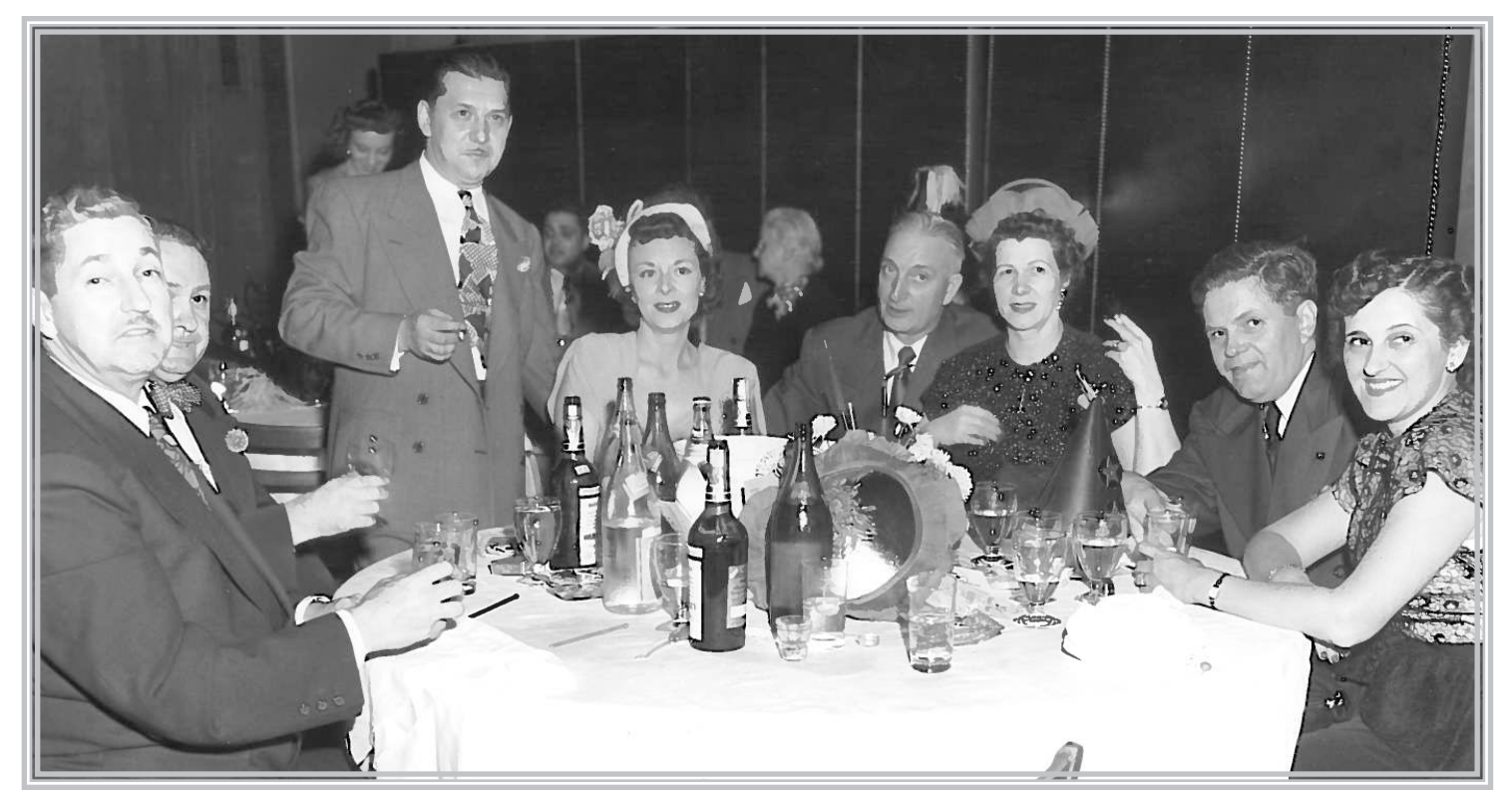
Tool & Die Institute's Annual Dinner | 1957

PRESORTED STANDARD U.S. POSTAGE PAID PERMIT NO. 319 PALATINE, IL