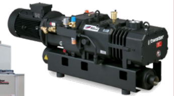
Elmo Rietschle S-VSI Vacuum Pump