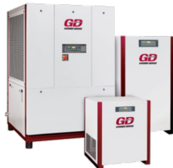
RNC Series Air Dryers