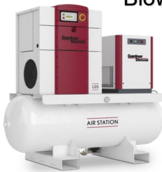
L-Series Air Station Compressor and Dryer

Blowers-Vacuum-Chillers-Oil Free Compressors-Nitrogen Generators