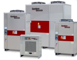
CHL Series Chillers