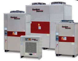
CHL Series Chillers