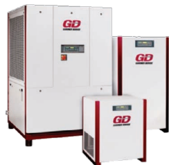
RNC Series Air Dryers