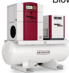
L-Series Air Station Compressor and Dryer

Blowers-Vacuum-Chillers-Oil Free Compressors-Nitrogen Generators