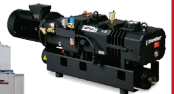
Elmo Rietschle S-VSI Vacuum Pump