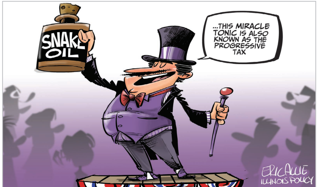
tma cartoon | by: illinois policy institute