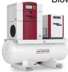
L-Series Air Station Compressor and Dryer

Blowers-Vacuum-Chillers-Oil Free Compressors-Nitrogen Generators