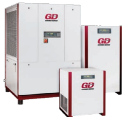
RNC Series Air Dryers