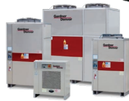
CHL Series Chillers